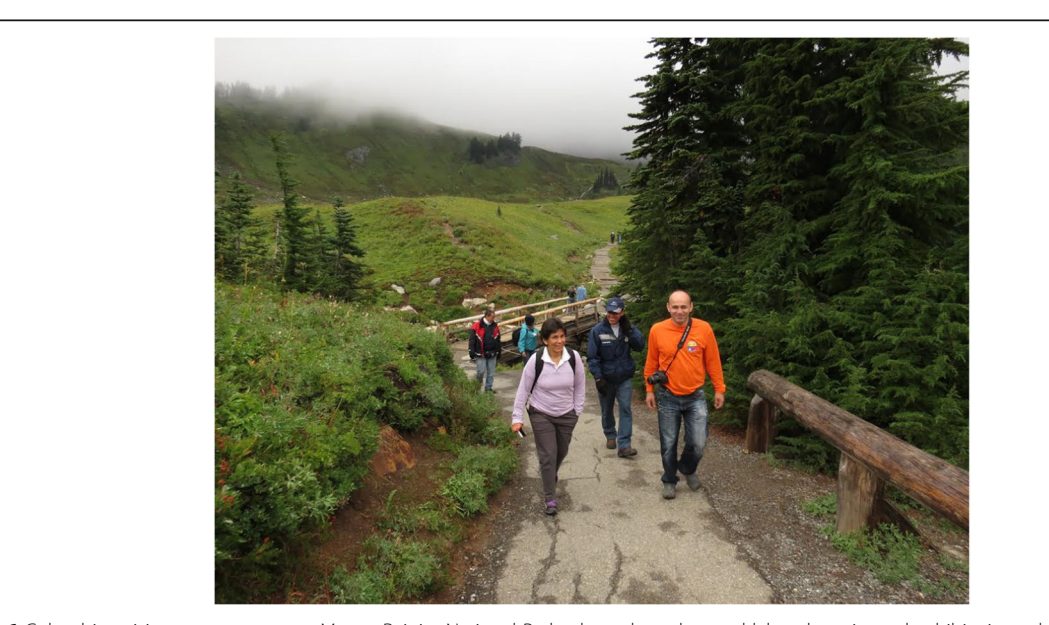
Fig. 6 Colombian visitors were guests at Mount Rainier National Park where they observed lahar deposits and exhibits intended to teach visitors about lahar hazards.