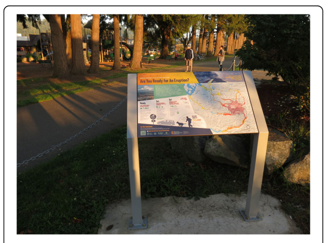
Fig. 8 This outdoor interpretive sign at Central Park in Orting, Washington was designed by some participants of the 2013 binational exchange and their agency colleagues. USGS photo by C. Driedger, October 10, 2014

Today, the fire chief draws a direct connection between the 2013 binational exchange and current coordinated plans for action within the fire department, with adjacent jurisdictions, and with school and city