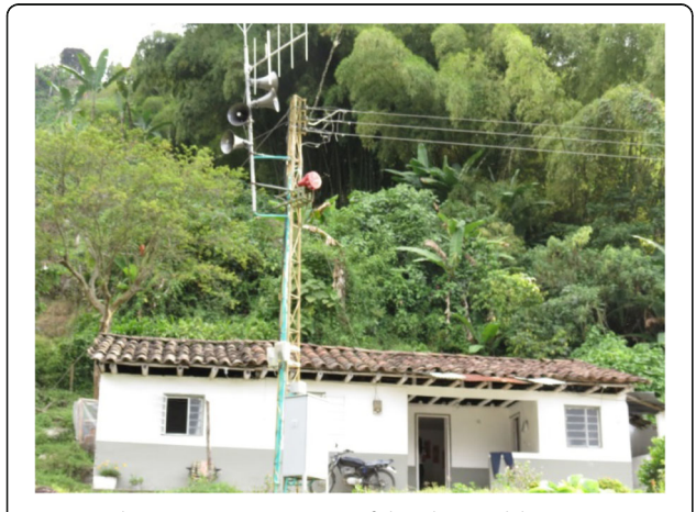
Fig. 7 In the upper center portion of the photo, a lahar siren system is visible mounted on a pole in the village of Viejo Rio Claro Chinchiná. Unlike in the US, local residents in Colombia have a personal role in lahar notification as they host and regularly test lahar siren devices installed beneath roof eaves and in public areas.

"During our visit to Washington State, we were able to gain an appreciation for the advanced nature of the emergency response systems, protocols, and